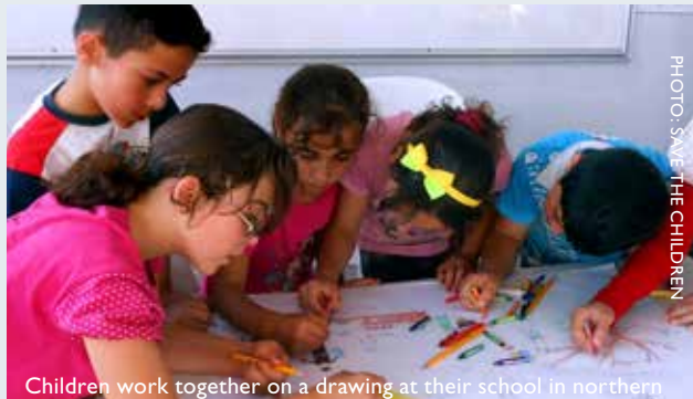
Syria which is supported by Save the Children

In such situations, Save the Children's Education and Child Protection Service Delivery Contingency Plan kicks in. This is part of our Conflict-Sensitive Education Operating Protocols, which include guidance on community-driven education and child protection, safety, security and well-being. The Contingency Plan sets out the steps that should be taken to ensure the continuation of education and child protection under various insecure circumstances, while the Safety, Security and Wellbeing Protocol provides a series of steps that should be taken to prepare, manage and respond to incidents.